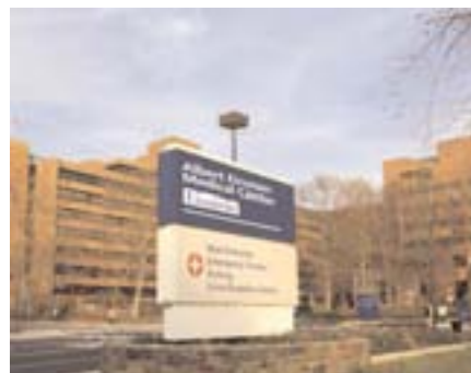
Albert Einstein Medical Center