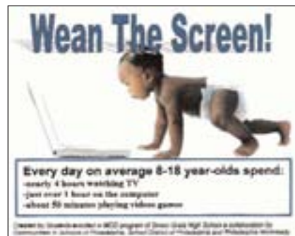
One of the handouts used to promote the campaign to increase community awareness about childhood obesity and the behaviors that contribute to it.

usher at a local movie theater. He says that he was able to land this job because of the interviewing skills he developed and the references he gained during his summers with WorkReady.